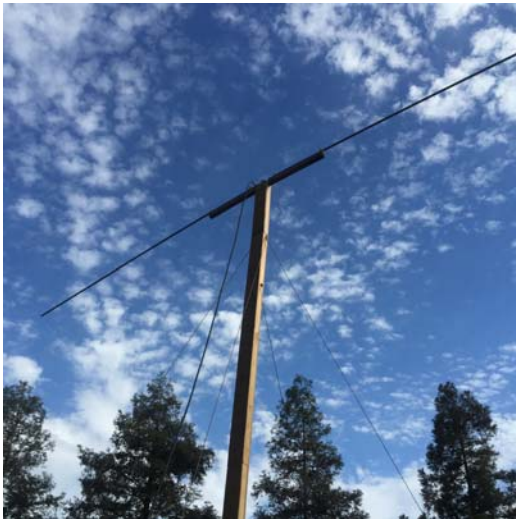
Portable Dipole from N6TCE

Sign up for the next HamCram of Licensing by clicking the link here .